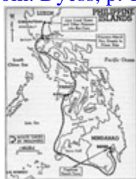
From: Dyess, p. 154