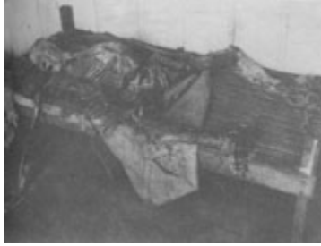
"Left for dead by the Japanese at Davao, Southern Philippines, 1945."