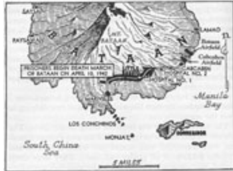
From: Dyess, p. 72