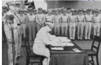
"General of the Army Douglas MacArthur signs as Supreme Allied Commander. Behind him (left) is Lt. Gen. Jonathan Wainwright, who surrendered to the Japanese after Bataan and Corregidor."