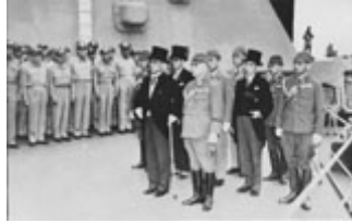
"Japanese surrender signatories arrive aboard the U.S.S. Missouri in Tokyo Bay for the ceremonies, September 2, 1945."

U.S. Army Photo, From: Buchanan, between pp. 412-413, photo # 25