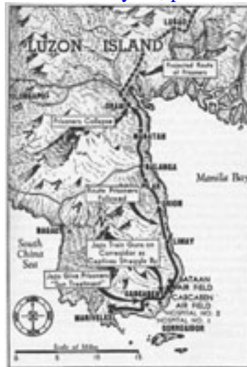
From: Dyess, p. 81