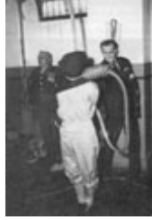
"Victor's justice - the Americans hang a C Class war criminal, by the book."

While hundreds were accused of war crimes, a little over two dozen were tried and sentenced. Over 300,000 Japanese were charged as B and C Class criminals, but all were not tried due to their vast numbers. Over 5,700 were brought to trial. Trials lasted anywhere from days to months. Sentences ranged from prison terms to executions. Only seven A Class criminals were put to death, four due to their treatment of POWs.