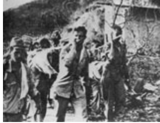
The Bataan Death March.