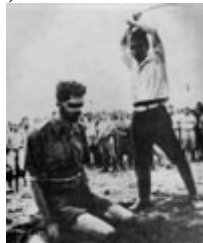
"Death of a POW."

Tojo's orders regarding POWs was very clear. Guards "must supervise their charges rigidly, taking care not to become obsessed with mistaken ideas of humanitarianism or swayed by personal feelings toward prisoners that might grow over a long incarceration." (50) Rarely did top government officials visit any Japanese prison camps. Therefore, the local commanders could do as they wished without reprimand. However, considering the indoctrination of Japanese troops, reprimand was highly unlikely. If the commander wished, he could make anything, even whistling, a crime and inflict any type of punishment, including execution. (51)