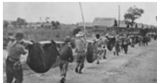
"The infamous Death March from Bataan in 1942, showing thinning file of prisoners carrying comrades who dropped along the way."

The Bataan Death March began at Mariveles on April 10, 1942. Any troops who fell behind were executed. Japanese troops beat soldiers randomly, and denied the POWs food and water for many days. One of their tortures was known as the sun treatment. The Philippines in April is very hot. Therefore, the POWs were forced to sit in the sun without any shade, helmets, or water. Anyone who dared ask for water was executed. On the rare occasion they were given any food, it was only a handful of contaminated rice. When the prisoners were allowed to sleep for a few hours at night, they were packed into enclosures so tight that they could barely move. Those who lived collapsed on the dead bodies of their comrades. For only a brief part of the march would POWs be packed into railroad cars and allowed to ride. Those who did not die in the suffocating boxcars were forced to march about seven more miles until they reached their camp. It took the POWs over a week to reach their destination. (49) Those on Corregidor would suffer the same fate as their fellow soldiers on Bataan did as they too were transferred to Bataan.