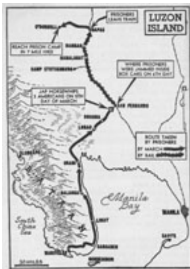
From: Dyess, p. 96