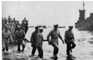
"Gen. Douglas MacArthur returns to the Philippines, October 20, 1944." Wide World Photos, From: Buchanan, between pp. 412-413, photo # 18

The Shinyo Maru with 750 POWs was sunk on September 7, 1944. Only eighty-two would be rescued by Filipino guerillas. This was followed by the sinking of the Arisan Maru on October 24, the first day of the battle of Leyte Gulf. The ship went down 200 miles off the coast of China. Of the 1,790 POWs eight were found, five survived. Nearby Japanese destroyers saw the POWs in the water and pushed them away when they came near. Finally, the Oryoku Maru went down on December 13. The 1,619 POWs were on the ship for forty-nine days. Amazingly, 1,300 survived. (56)