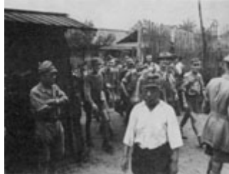
"Liberation - prisoners wearing airdropped clothes, with some flesh back on their bones." From: Daws, p. 238